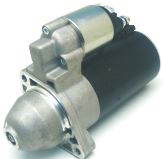
LES0388 12V / 1.8kW

CW / 9 Teeth Used On: BMW 1.3 Series 2003-12 BMW 5, 6, 7 Series X3 & X5 2007->> Replaces: Bosch 0-001-115-040, -041, -045, -046 BMW 12-41-7-794-952, 796-892, -798-035, -798-036