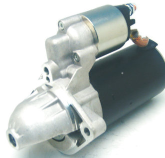
LES0387 12V / 1.8kW

CW / 9 Teeth Used on: New Holland 4230 & 4220 Ford D 1992-99 New Holland L60, L65, L75 1996-97 Replaces: Bosch 0-001-230-007, -010, -023 New Holland 500325145, 500338952