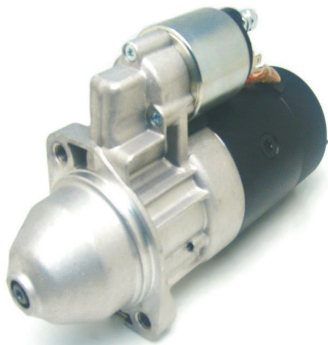
LES0377 12V / 2.2kW

CW / 9 Teeth Used On: Audi 100 2.5 TDi, 2.0 D & 2.4 D 1990-94 Audi A6 2.5 TDi Avant & Quattro 1995-97 VW LT 28-35 2.4 D & LT 40-45 1978-96 Replaces: Bosch 0-001-218-012, -013, -018 VAG 039-911-023, -023C, -023CX, -023D