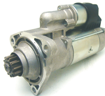
LES0383 24V / 5.5kW

CW / 13 Teeth Used On: Mercedes C180, C200, C220 2009-13 Mercedes E220, E250, E300, GLK 200 2009->> Replaces: Bosch 0-001-149-400, -401 Mercedes-Benz 651-906-12-00, -23-00